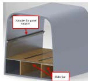
Figure 3 - Unfolded bed frame to showcase entire width of bed and L-bracket, which provides support for panels in the upright position.