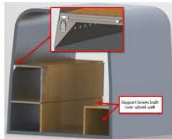
Figure 1 - Folded bed frame in the upright position for travel to maximize storage. Mattresses housed inside folded box, while top of panel provides a workbench option.