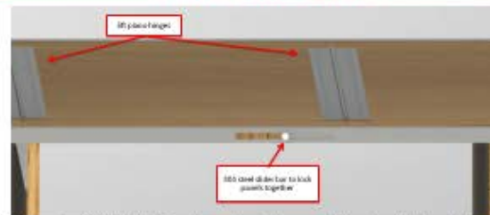
Figure 2 - Unfolded bed focusing on piano hinges and slider bar, which provides a rigid support for the panels. The slider bar is maneuvered through an internal stainless steel bar to be moved into the locked and unlocked positions.