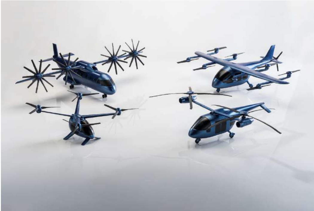
Figure 2. eVTOL Prototypes