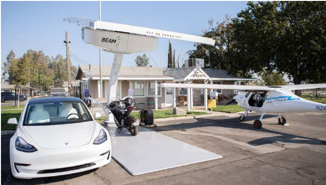
Figure 5. Beam EV ARC Charging Electric Aircraft and Car at Reedley, CA