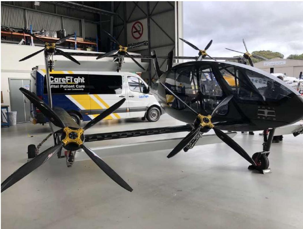
Figure 1. Electric Air Ambulance from AMSL Australia