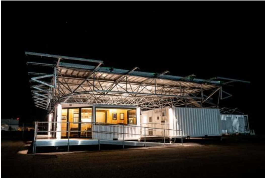
Figure 4. Modular Facility Electro Aero